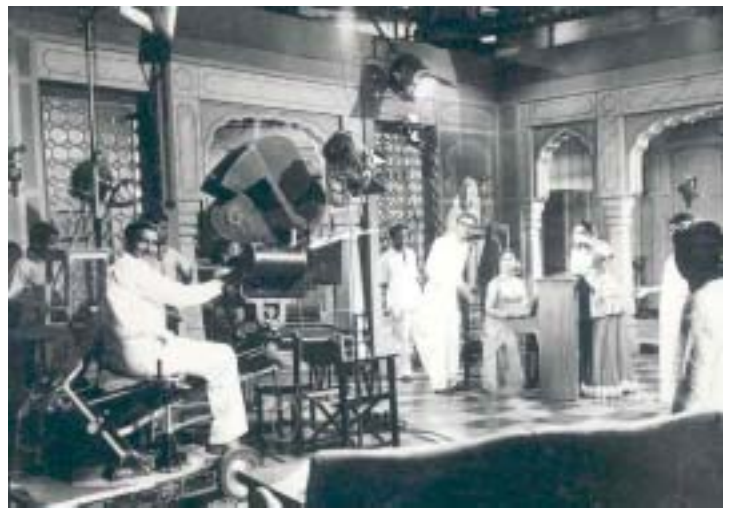
L.V.Prasad on the sets of Miss Mary with Meena Kumari, 1957