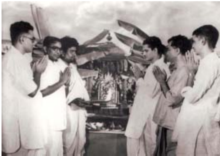
L.V.Prasad during the launch of the shoot for Pempudu Koduku, Telugu, 1950's