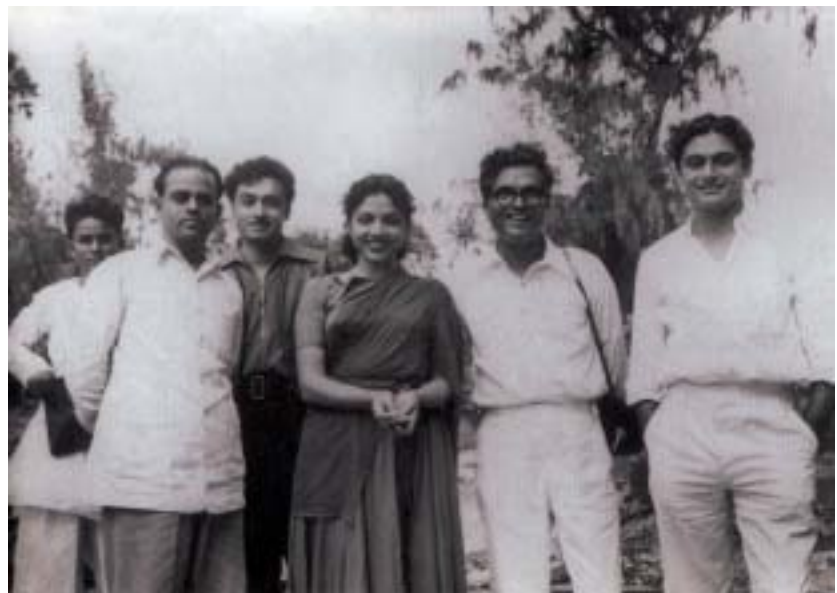
L.V.Prasad with Bhanumati and Anoop Kumar on the sets of Rani directed by him in 1952