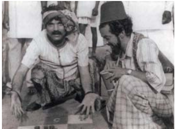
L.V.Prasad during a carnival in Vijaya Vauhini Studios, Chennai