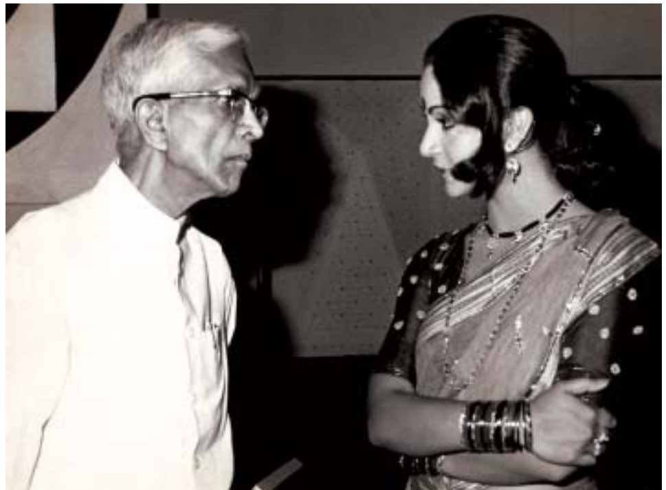
L.V.Prasad with actress Rati Agnihotri during the shoot of Mujhe Insaaf Chahiye in 1982