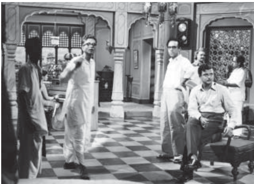
L.V.Prasad on the sets of Miss Mary with Gemini Ganesan (Sitting) and Om Prakash (Far behind, Looking at the Camera), 1957