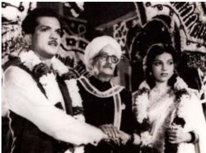
L.V.Prasad with Bhanumati in a still from Grihapravesham, 1945 in which he acted and directed